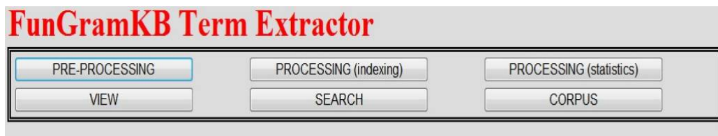
Figure 4. Main menu of FunGramKB Term Extractor

that show a tf-idf index below 3 are not statistically specialised. It is important to notice that the extraction process in FunGramKB is semi-automated and that the ultimate decision of what counts as a specialised term relies on the criterion of the terminologist. Figure 4 below shows the main menu of FGKBTE containing the principal functions of the tool: